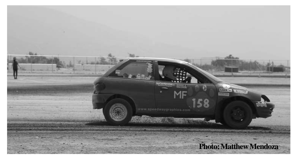
Brent Blakely - 2015 Rally 2wd Rallycross Champion