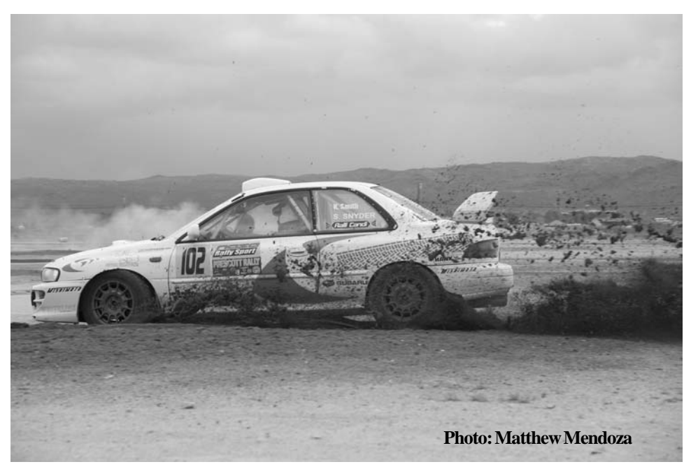
Kurt Smith 2015 Rally 4wd Rallycross Champion

The NNRC recognizes two classes. The NNRC All Wheel Drive (AWD) class includes all four-wheel drive vehicles. The NNRC Two Wheel Drive (2WD) class contains all two-wheel drive vehicles.