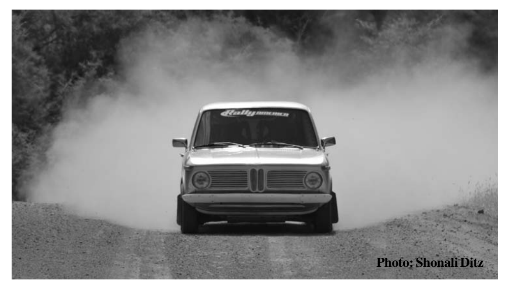
Elina Lipilina - 2015 Performance Stock Class Rally Champion