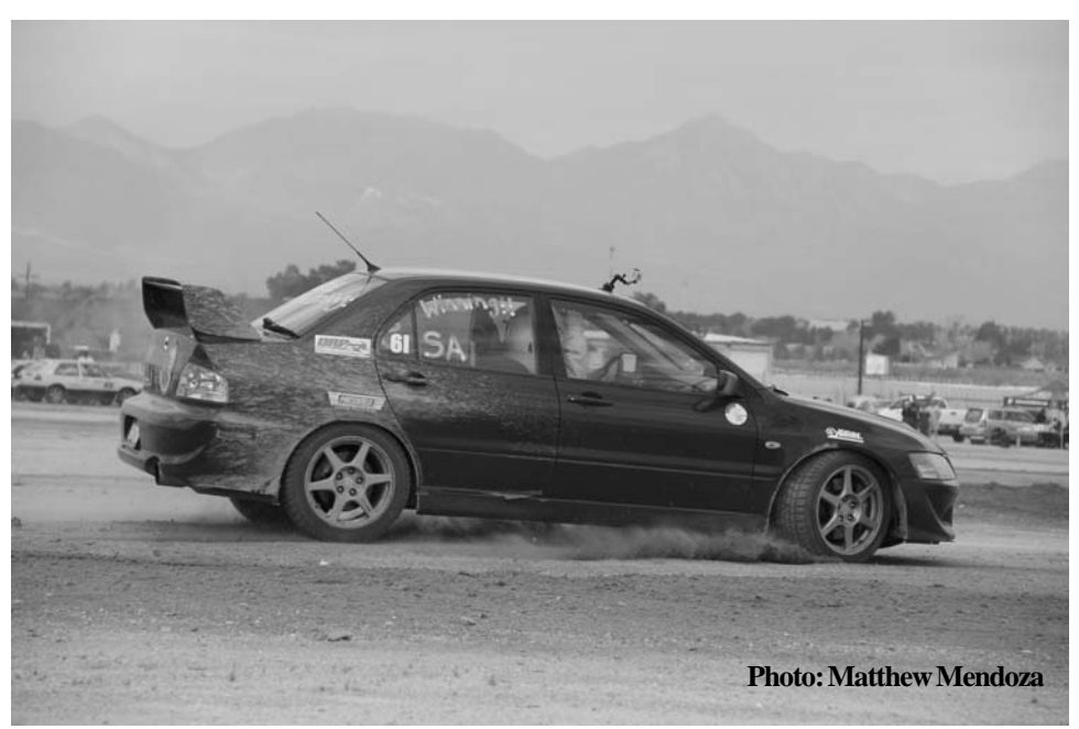
Lon Peterson 2015 Stock 4wd Rallycross Champion