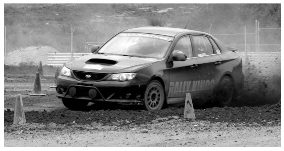
Thomas Bloess - 2012 Street Mod 4wd Rallycross Champion